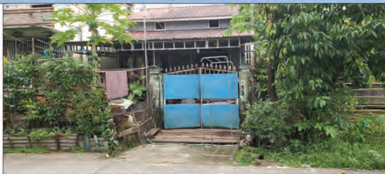
Below: Outside of the church in Myanmar