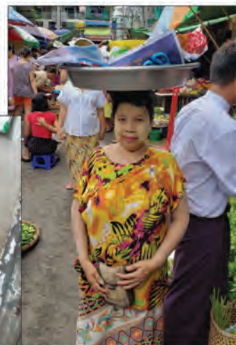
Above: Children at a church in Myanmar that provides free education and hope for children and a woman carrying groceries in the marketplace