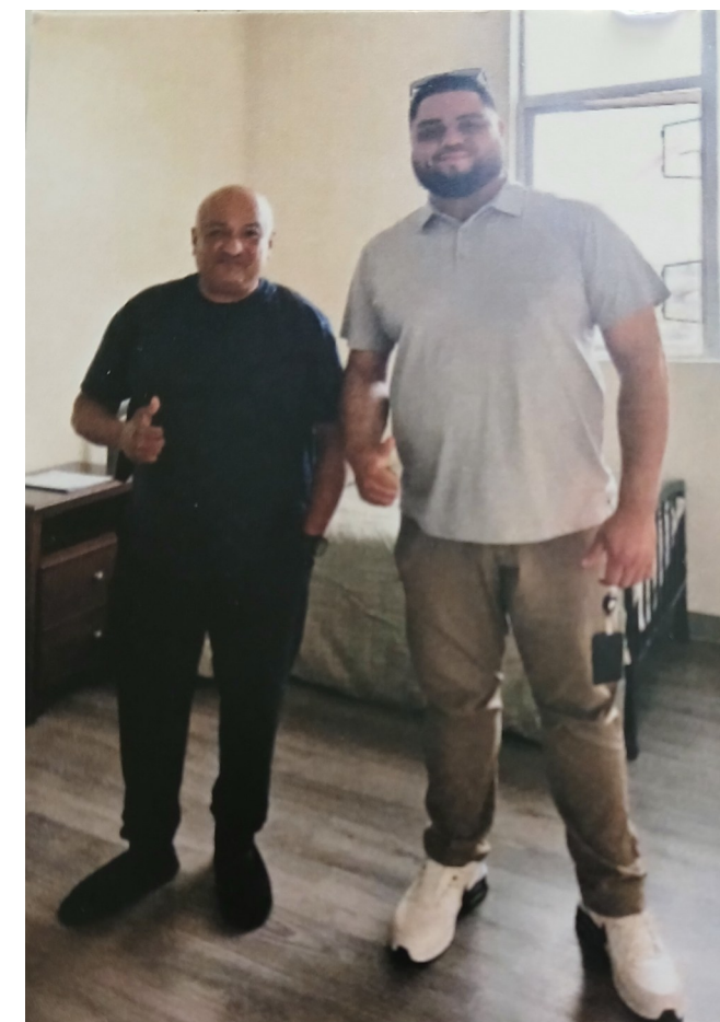
A recent graduate (left) with his Housing Navigator, in his new permanent home thanks to the help he received from Grandma's House of Hope.