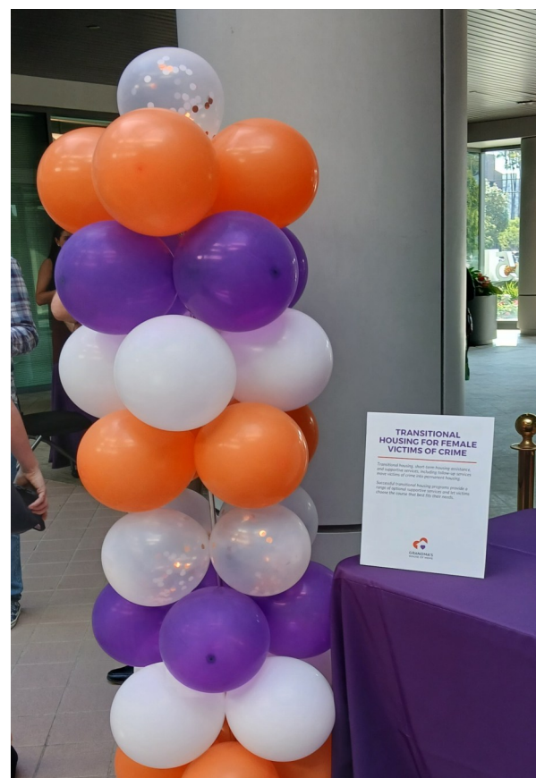
Top Right and above: Photos from the Open House