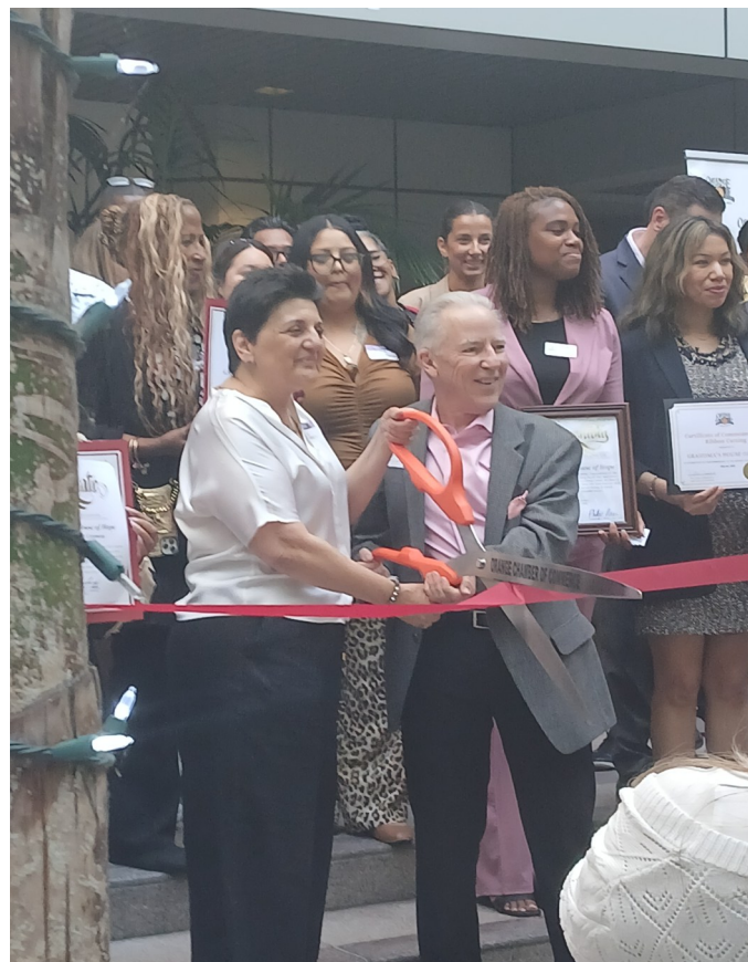
Grandma's House of Hope CEO and city official cutting the ribbon.