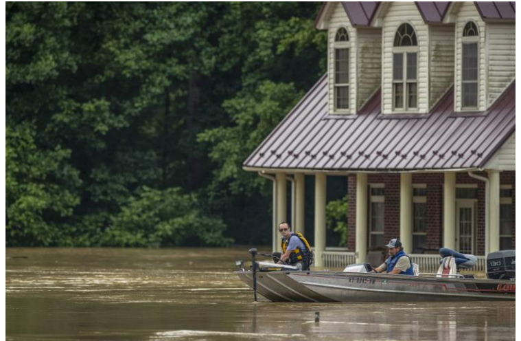
Photo: Homes are flooded by Lost Creek, Kentucky, on Thursday, July 28, 2022. Heavy rains have caused flash flooding and mudslides as storms pound parts of central Appalachia. Kentucky Gov. Andy Beshear says it's some of the worst flooding in state history.

Thank you to all who supported Kentucky flood relief! Your gifts went to Convoy of Hope via the National Association of Congregational Christian Churches. Below is an article posted by Convoy of Hope: