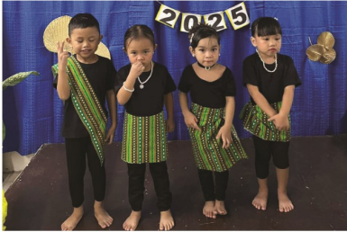
Amazing Love Learning Center

Buwan ng Wika is celebrated every August in Philippine schools to honor the national language, Filipino, and the country's rich cultural heritage, as mandated by Proclamation No. 1041 (1997). Schools mark the occasion with poetry, dances, songs, plays, and other cultural activities. Selected MMP schools— Amazing Love Learning Center, Happyland Christian Learning Center, Joyland Playschool & Child Care Cente, Kinder Bright Montessori School, Maddela Baptist Christian School and Racham Wilbeth School Inc. (Negros Occidental) —also joined in celebrating this meaningful event.