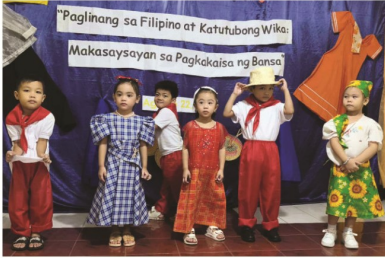
Happyland Christian Learning Center