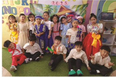
Kinder Bright Montessori School