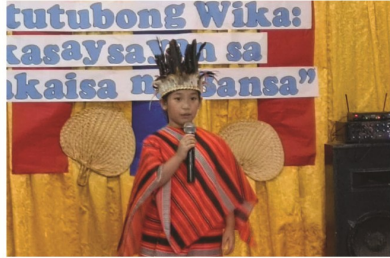
Maddela Baptist Christian School