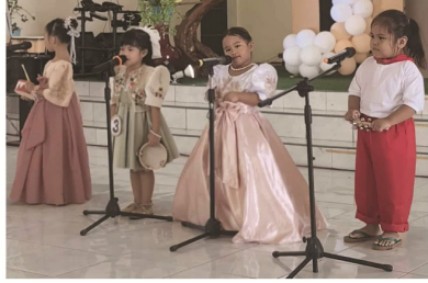
Racham Wilbeth School Inc.