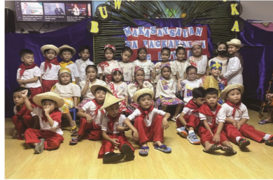
Joyland Playschool & Child Care Center